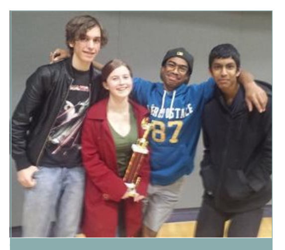
McKinley Students: Think College, Think Careers, Think Global Economy